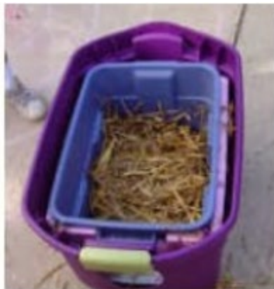
Second Container filled with Straw