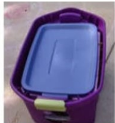
Cover Second Container